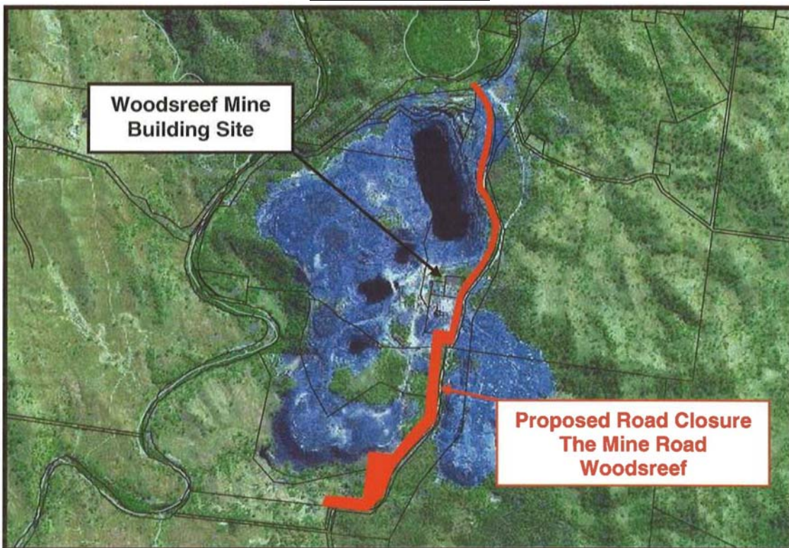
PROPOSED ROAD CLOSURE- THE MINE ROAD WOODSREEF