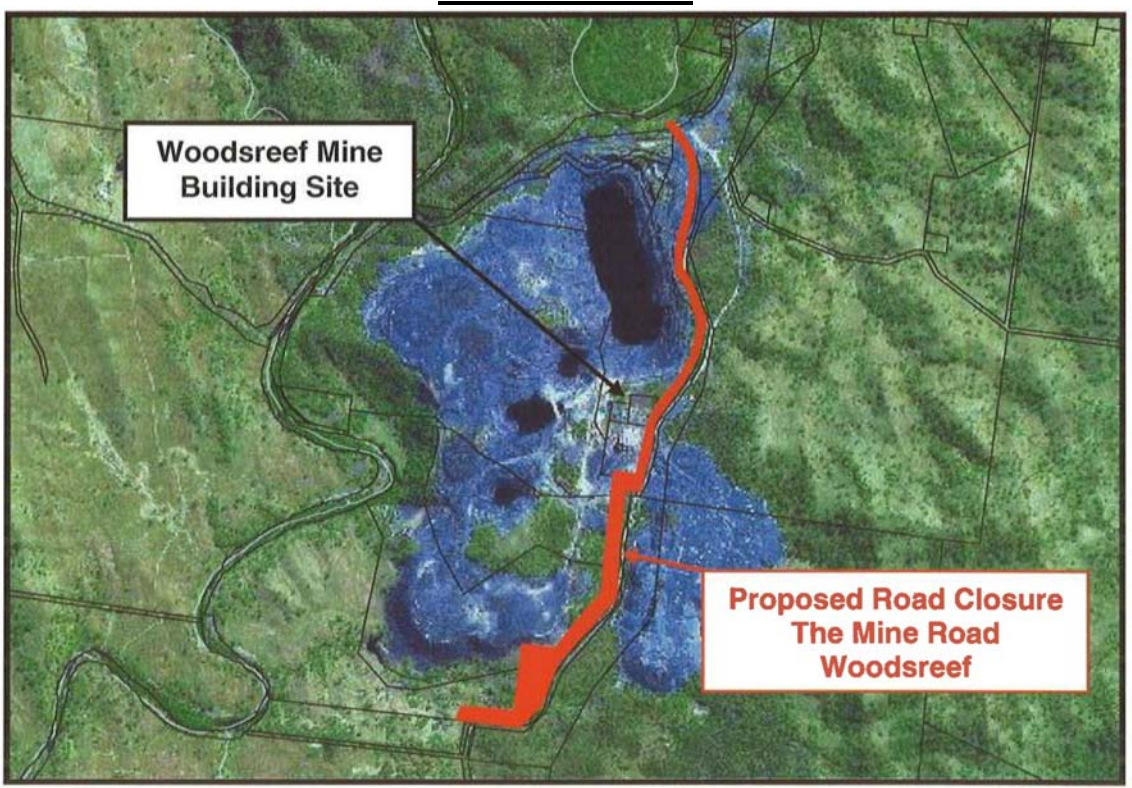
PROPOSED ROAD CLOSURE- THE MINE ROAD WOODSREEF